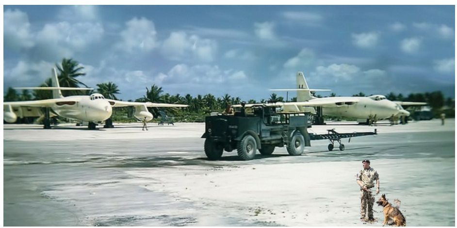
RAF 49 Sqd on Christmas Island